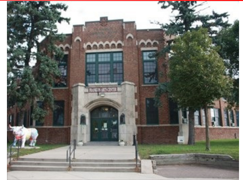
Franklin Art Center